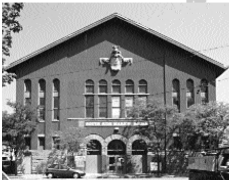
The South Side Market House is now a community center.